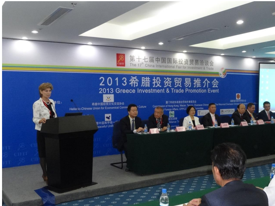
Photo from CIFIT 2013 in Xiamen China